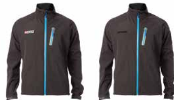
High-quality and functional softshell jacket in black 04