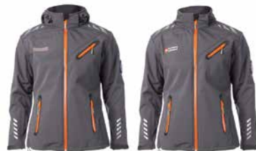
The perfect outdoor jacket with sporty look 16