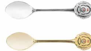
Collector Spoon / Sugar Spoon / Teaspoon / Souvenir spoon 02