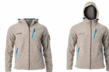
Hooded-Hoodie grey 05