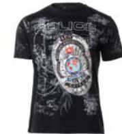
T-Shirt IPA retro black 15