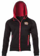
IPA Hooded-Pullover / Hoodie black / red 06