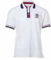
Men's white Polo shirt with IPA Logo 13