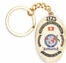
IPA Switzerland Keychain 10