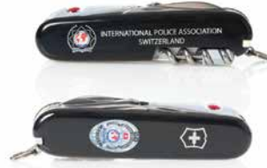
Medium Pocket Knife Spartan Lite with LED Light 12