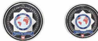
IPA Switzerland Coin / coin - small 09