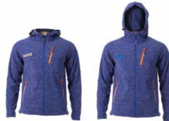
Hooded-Hoodie blue 04