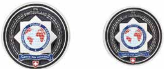
IPA Switzerland Coin / coin - large 08