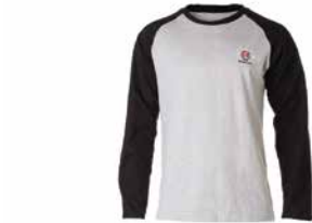
Long-sleeved gray shirt with IPA Logo 11