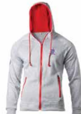
IPA Hooded-Pullover / Hoodie gray / red 06