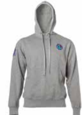
IPA Hooded-Pullover / Hoodie 05