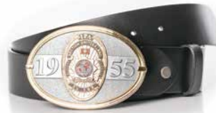
Clasp "Buckle" IPA Switzerland in gold gloss-silver matt, with leather belt 02