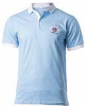
Short Sleeve Polo Shirt light blue-white with IPA Logo 13