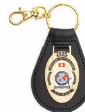
IPA Switzerland Keychain 10