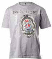
T-Shirt IPA retro gray 16