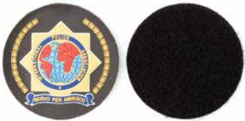
High quality 3D Rubber Patches with IPA Logo 03