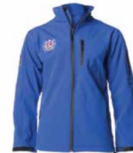
Softshell blue functional jacket with IPA Logo 15