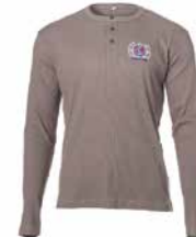
Men's long-sleeved gray shirt with IPA Logo 12